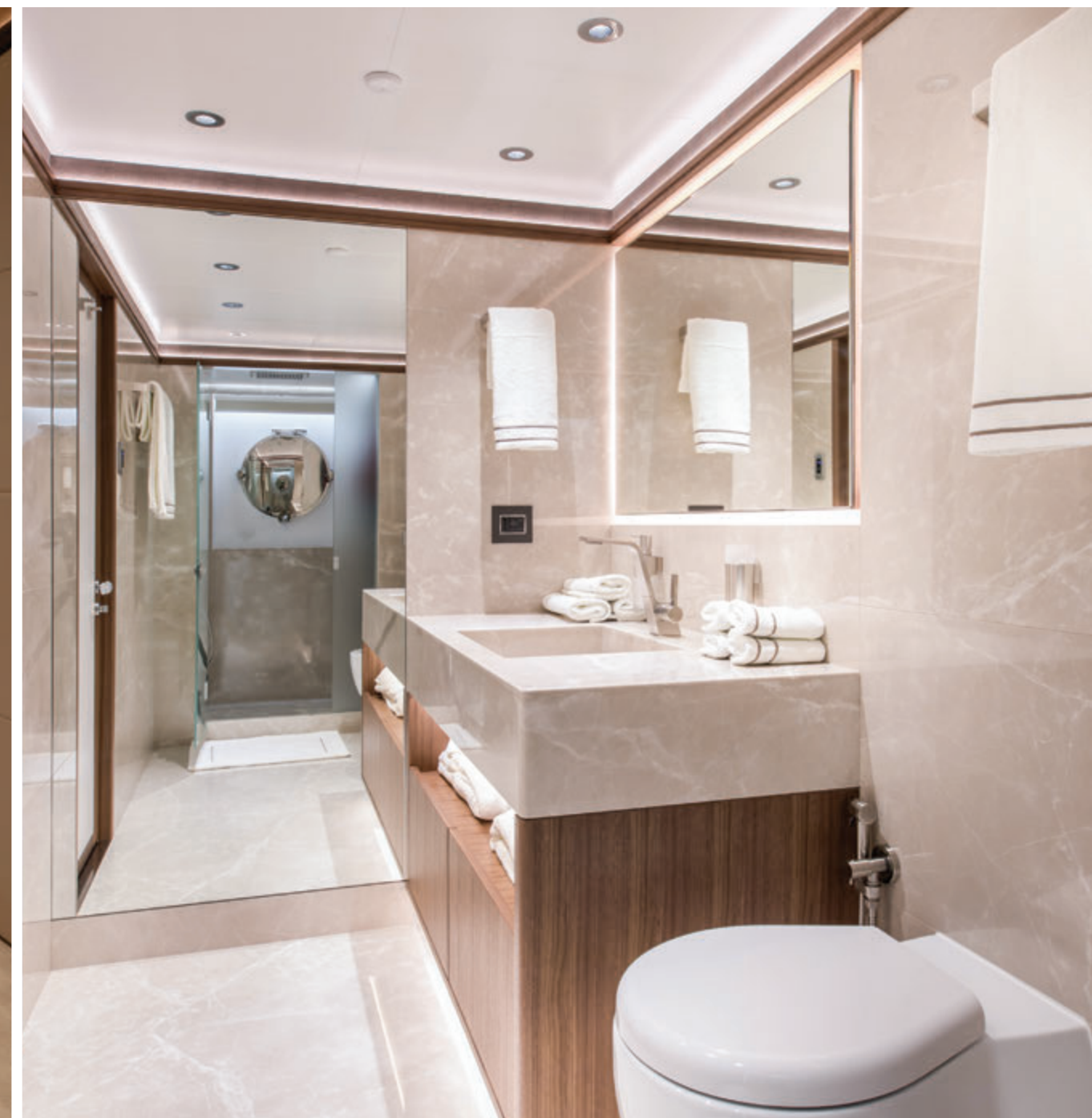
Double Guest En Suite