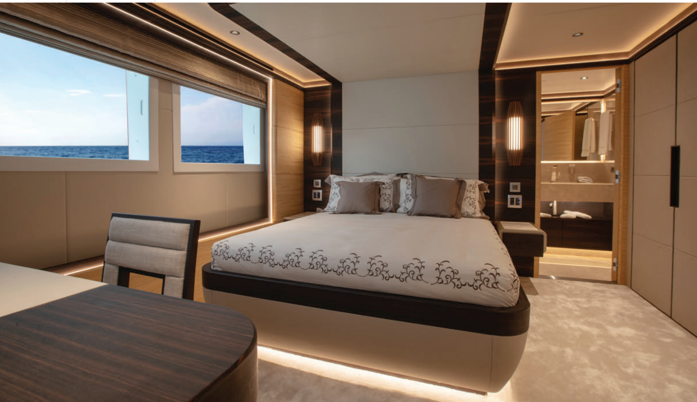
Double Guest Stateroom