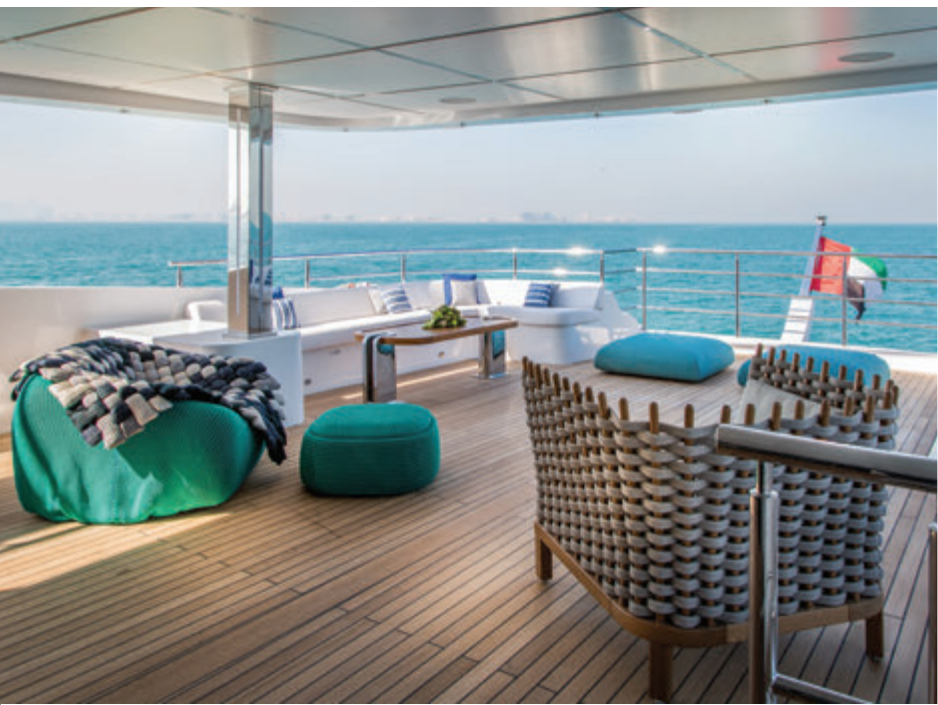
Upper Deck Seating Area