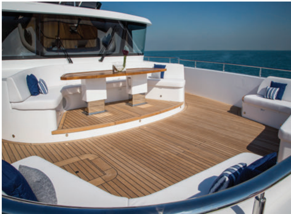
Bow Seating Area