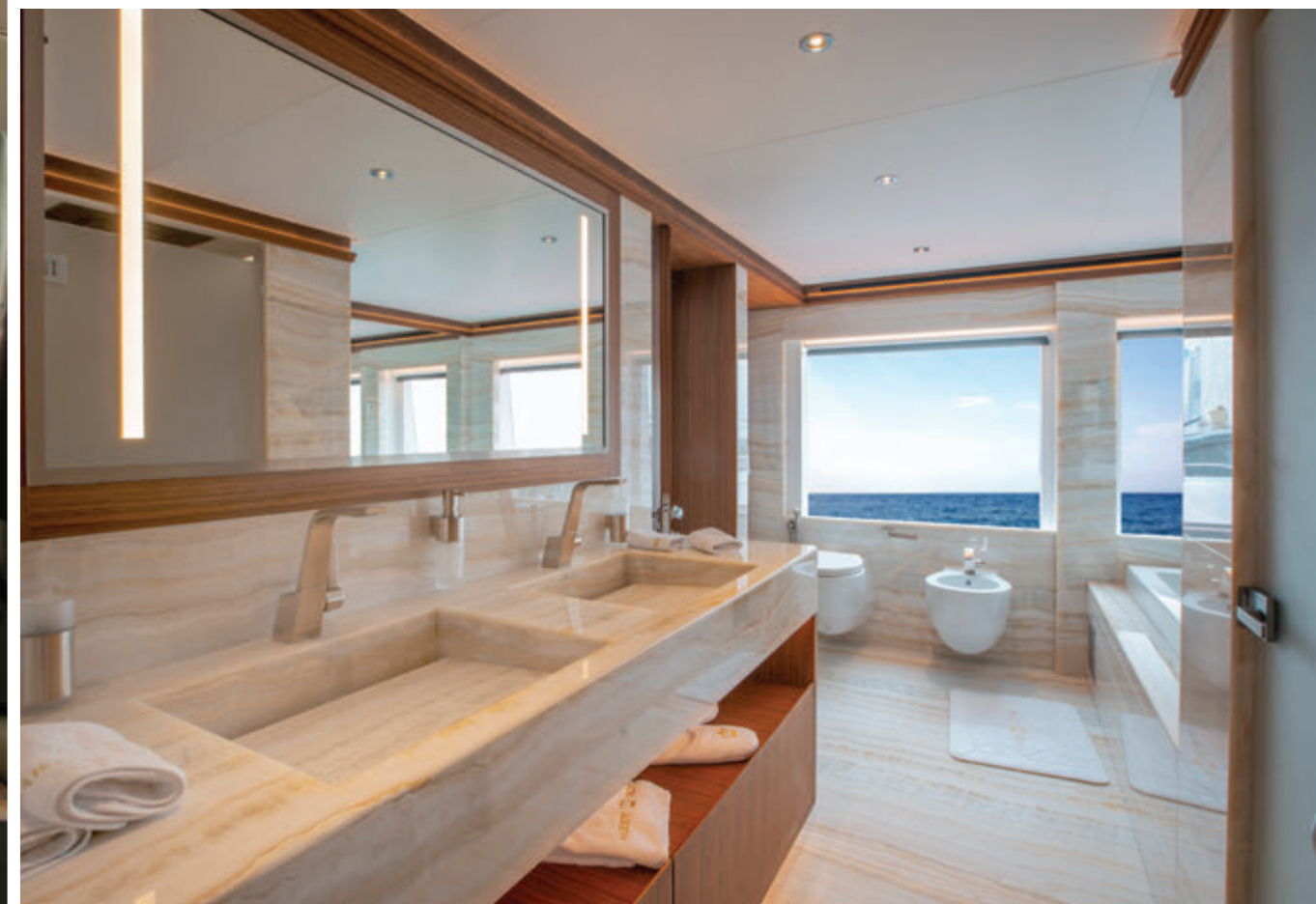
Top. Owner's Balcony | Bottom. Owner's En Suite